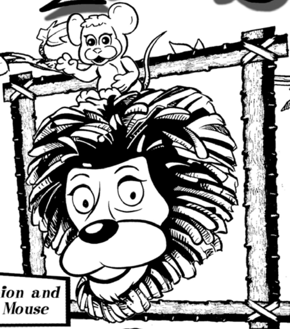
The Lion and The Mouse