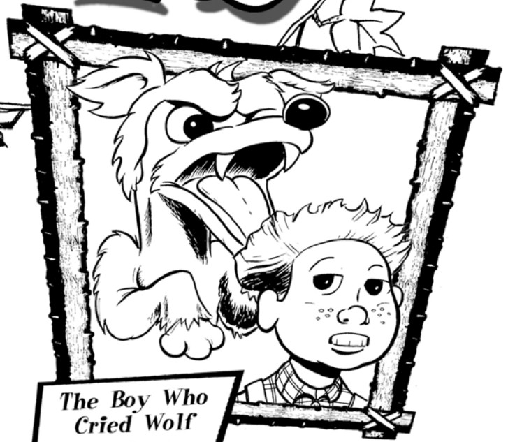
The Boy Who Cried Wolf